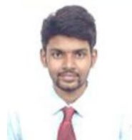
Contributed by: S. Narendran , HR Executive, Corporate, Chennai

The classic Sudoku game involves a grid of 81 squares. The grid is divided into nine blocks, each containing nine squares. The rules of the game are simple: each of the nine blocks has to contain all the numbers 1-9 within its squares. Each number can only appear once in a row, column or box.